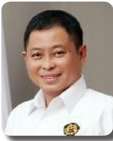
Hon. Mr. Ignasius Jonan Minister of Energy and Mineral Resources of the Republic of Indonesia

Ignasius Jonan (born 21 June 1963) is the Indonesian Minister for Energy and Mineral Resources serving under President Joko Widodo's administration. He is a former Indonesian Minister of Transportation and a former CEO of the Indonesian government-owned railway company, PT Kereta Api Indonesia (PT. KAI) which he headed from 2009 to 2014.