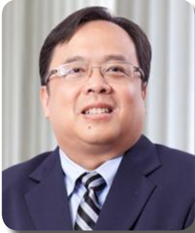
Hon. Prof. Dr. Bambang Brodjonegoro Minister of National Development Planning of the Republic of Indonesia

The opportunities to contribute to his country as the Minister of National Development Planning and Minister of Finance has established Dr. Brodjonegoro's career firmly in integrating Indonesia's development planning, financing, and economic stabilization. As the world's 4 th most populous country in the world, Indonesia is moving towards a sustainable economic growth, which can be seen from the emerging annual GDP and rapid regional development in various industries. In line with SDGs (Sustainable Development Goals) targets, the government of Indonesia has committed to improve sub-national economy by prioritizing infrastructure development, coupled with the provision of education and health care services, to achieve near term vital goal of economic decentralization sustainability.