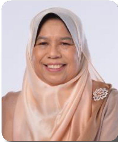
Hon. Ms. Zuraida Kamaruddin WPL Ambassador Minister of Housing and Local Government of Malaysia

The Honorable Madam Zuraida binti Kamaruddin (born 14 March 1958) is a Malaysian politician. She is the current Member of Parliament for Ampang, Selangor and serves in the Cabinet of Malaysia as the Minister of Housing and Local Government from 21 May 2018. She is also the Women's Chief of the People's Justice Party (PKR), a component party of the Pakatan Harapan (Alliance of Hope) ruling coalition in Malaysia.